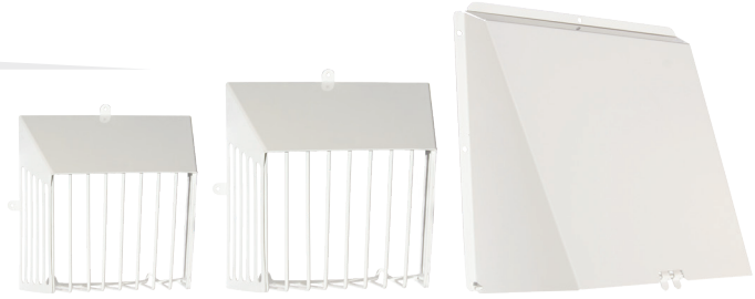
3 Models for Universal Application and Defense against Squirrels & Birds

Select the Defender for serious protection.